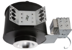
DLED-9560 [Non-IC Rated]